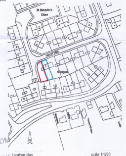
Location plan scale 1:250